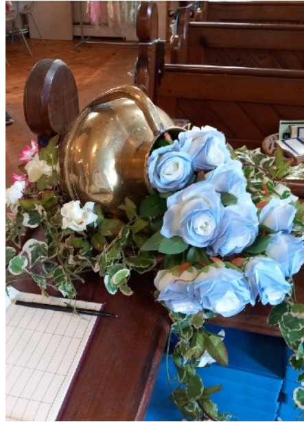
Some details of the Flower Festival arrangements, watering cans in the arch, blue roses at the door, lobsters in the net and a working fountain hidden away.